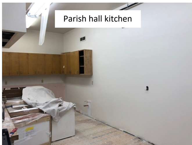
Parish hall kitchen

And the parish hall kitchen is going to be so nice!