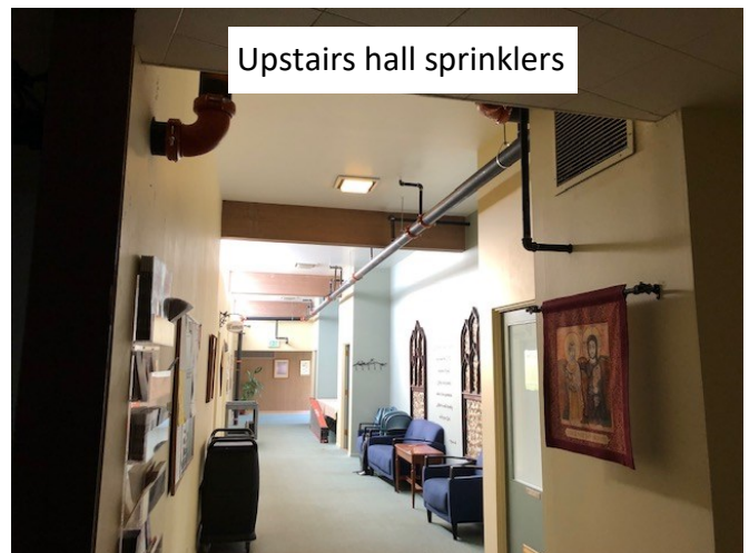
Upstairs hall sprinklers

And the parish hall kitchen is going to be so nice!