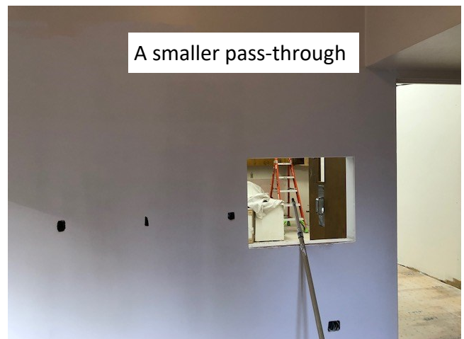
A smaller pass-through