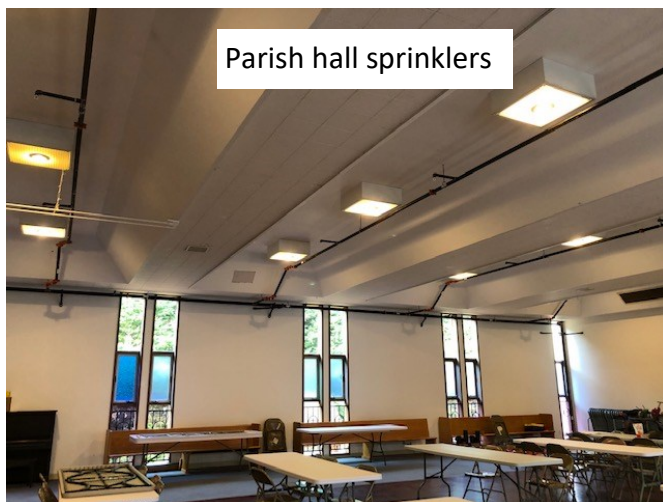
Parish hall sprinklers

The fire sprinkler system is being installed throughout the church (and will be painted to match the walls). We'll be better protected when it's done!